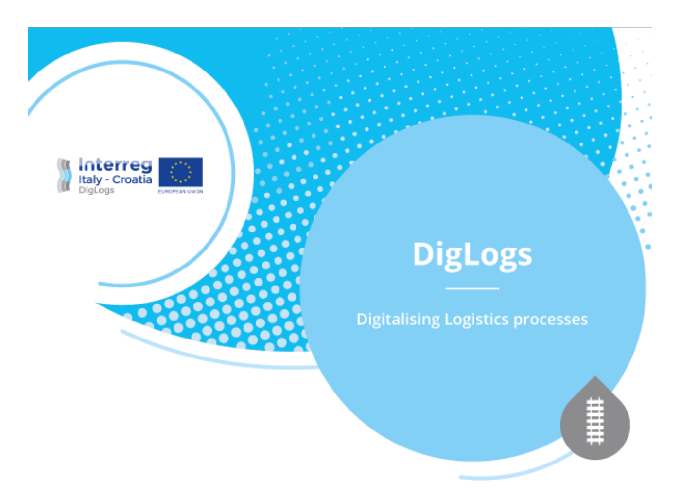
DigLogs newsletter n. 10 - September 2020

"Diglogs project partners are still successfully completing the project tasks with slight delays caused by the COVID -19 pandemic. The project duration has therefore been extended by 6 months, until December 31<sup>st</sup> 2021. Currently, each pilot owner is detailing a pilot work plan, which will be validated by all project partners. Pilot actions should mimic real solutions, both in the freight and the passenger sector. The assessments will then be collected in a