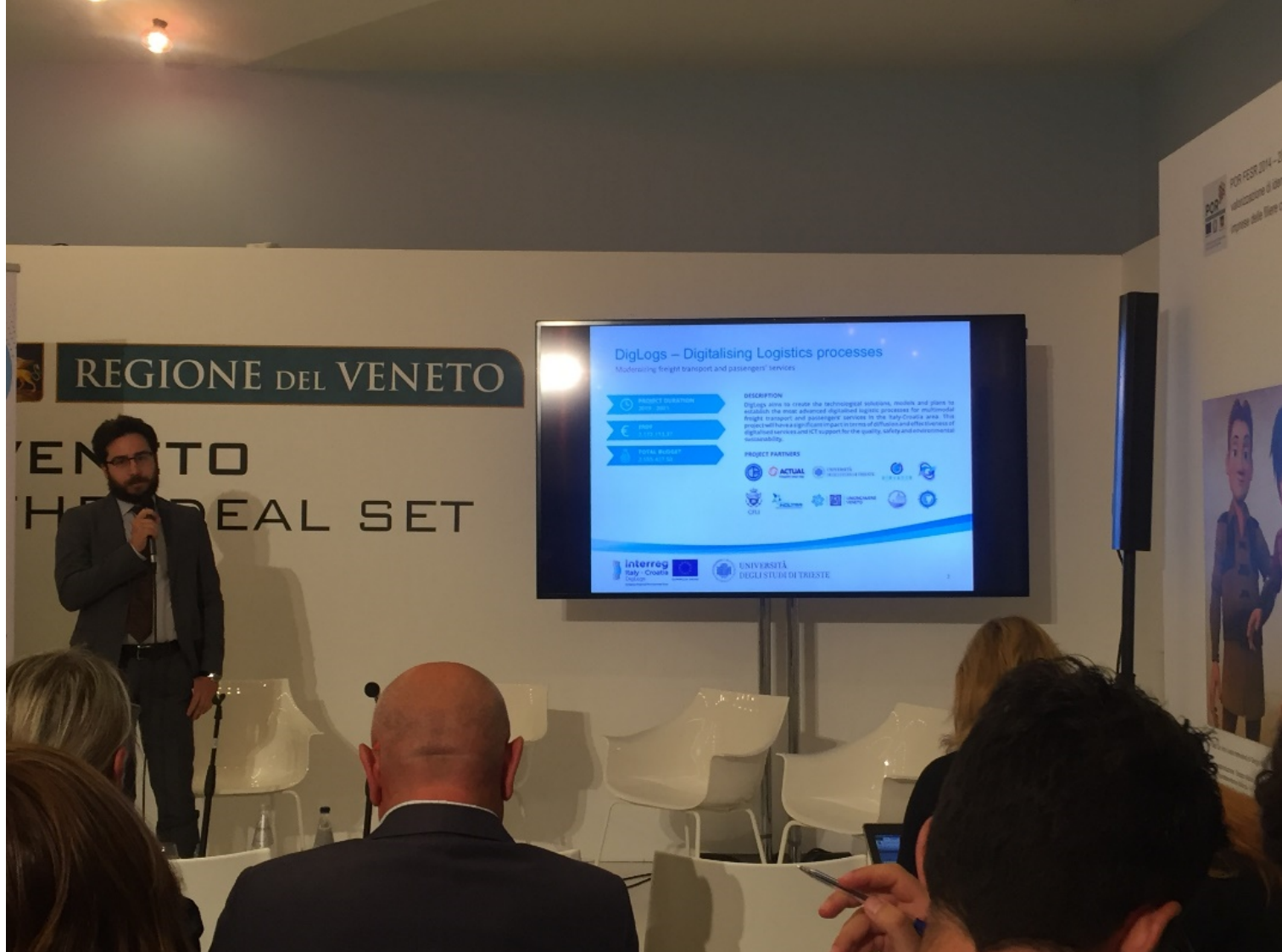
The DigLogs presentation at Venice International Film Festival 2019.